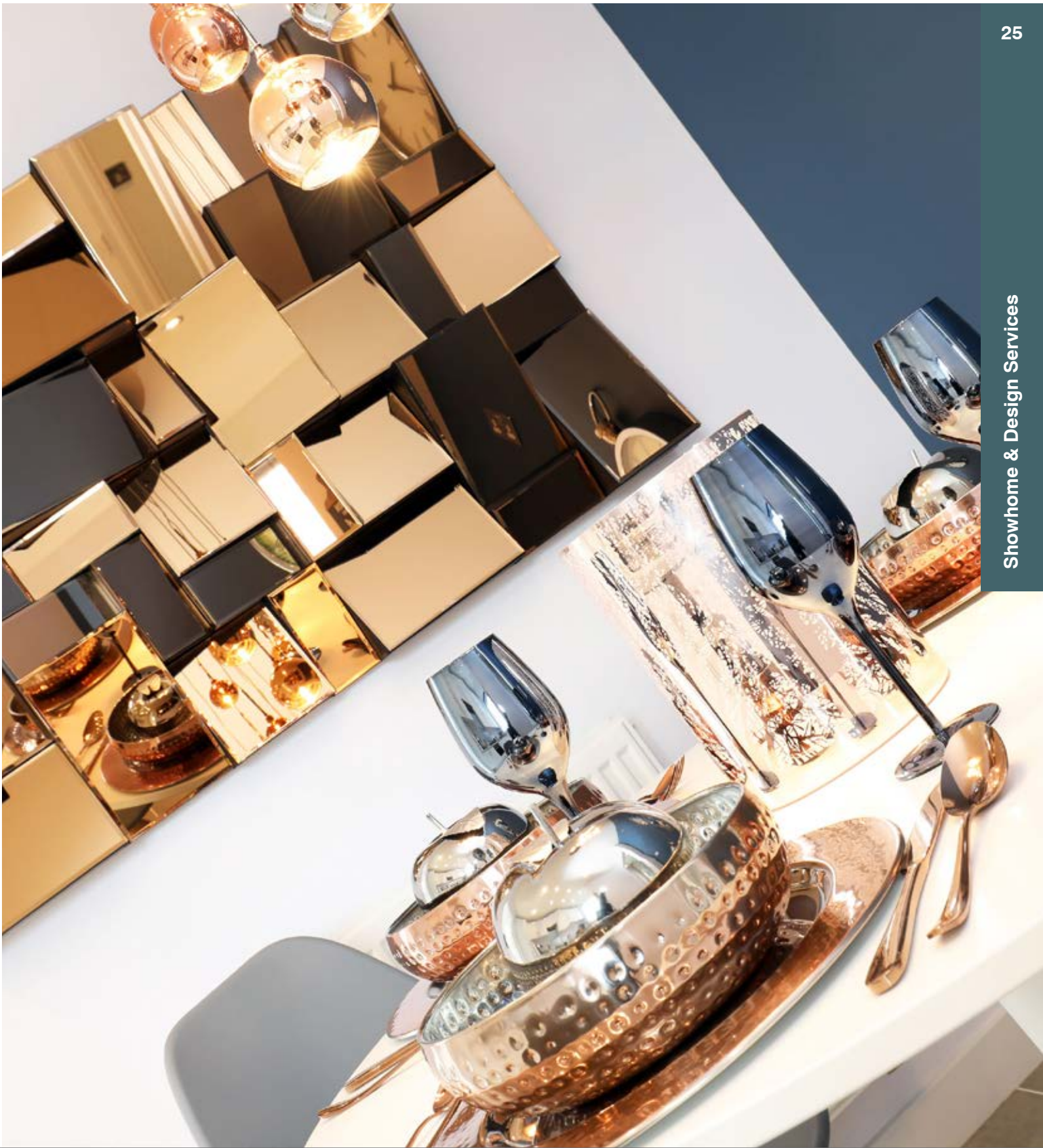
Showhome & Design