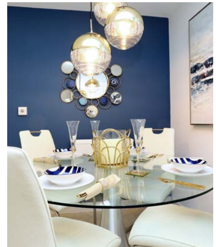
Showhome & Design